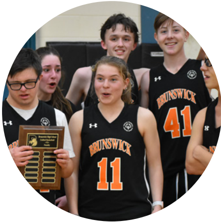
Brunswick High School uniforms: Play Unified roundel on left chest