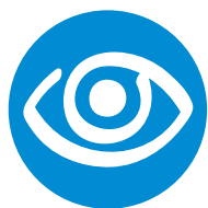
Opening Eyes: Vision