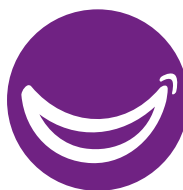
Special Smiles: Dentistry