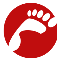
Fit Feet: Podiatry