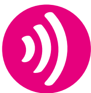
Healthy Hearing: Audiology