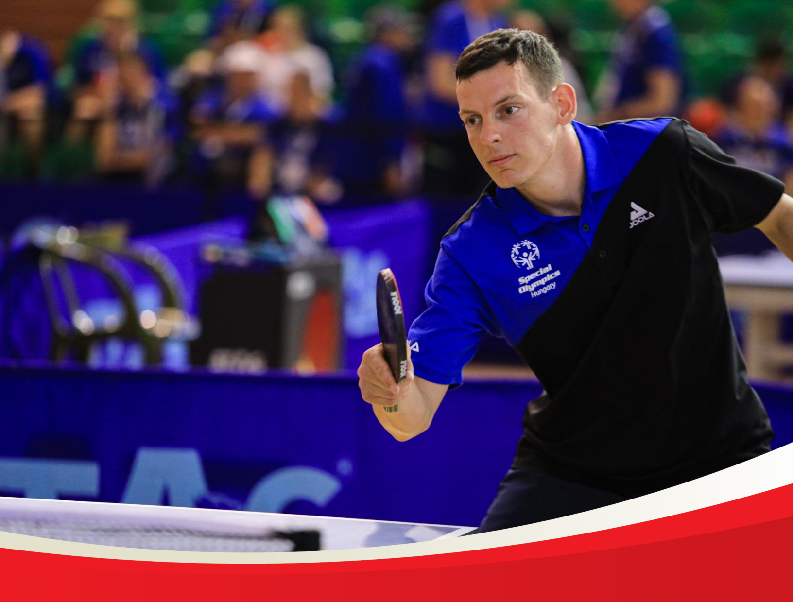
Table Tennis Sport Rules