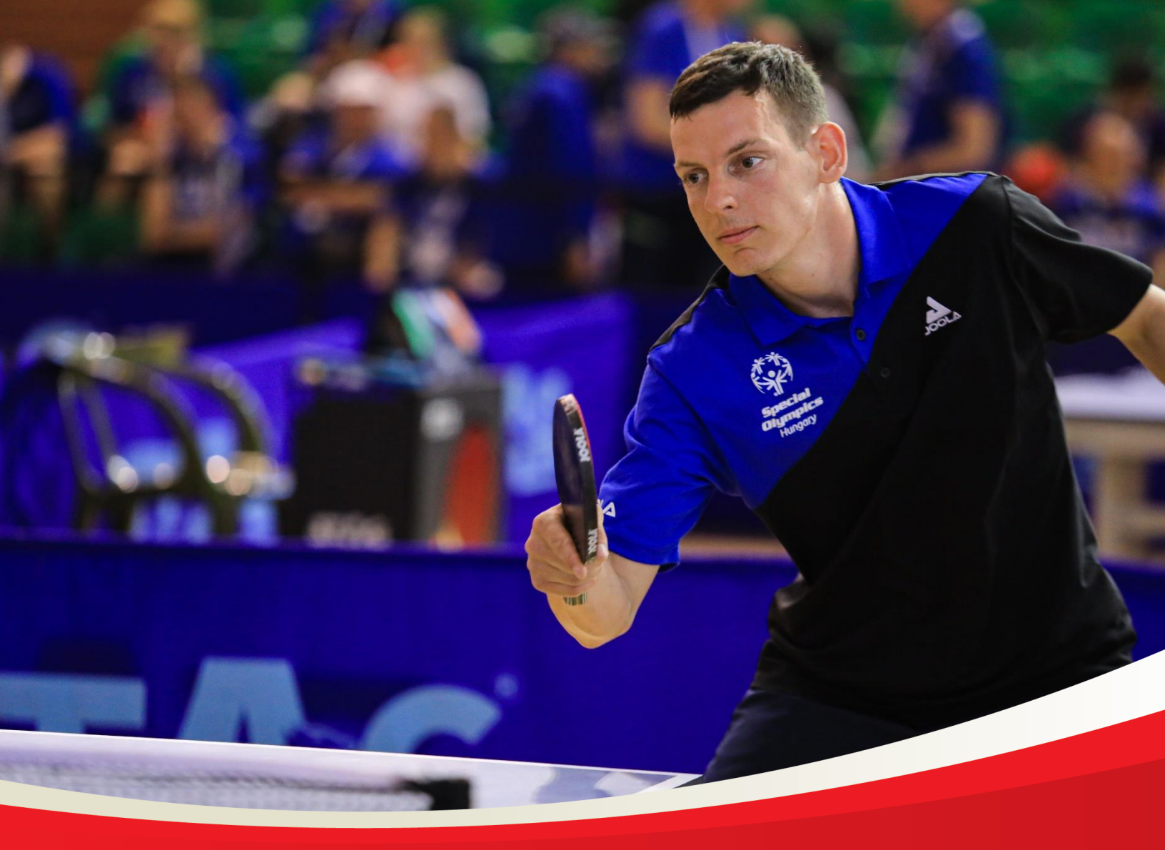
Table Tennis Sport Rules