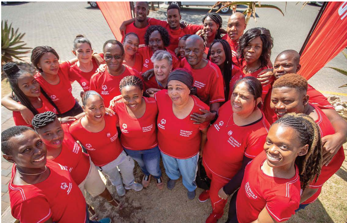
Siblings and other family members who participated in the Special Olympics Africa Sibling and Family Workshop in Johannesburg, South Africa pose for a group photo.

Eunice Kennedy Shriver founded Special Olympics in 1968. Eunice had a sister, Rosemary, who had ID. She and Rosemary grew up playing sports together and with their family. In those days, there were not many programs for people with ID. Eunice started Special Olympics to offer people with ID “the chance to play, the chance to compete and the chance to grow.” There are 200 million people with ID in the world. Our goal is to reach out to every one of them – and their families, too. Special Olympics reaches out through trainings, competitions, health exams and fundraising events. We also create chances for families, community members and others to meet and participate. Everyone can change attitudes and support athletes together!