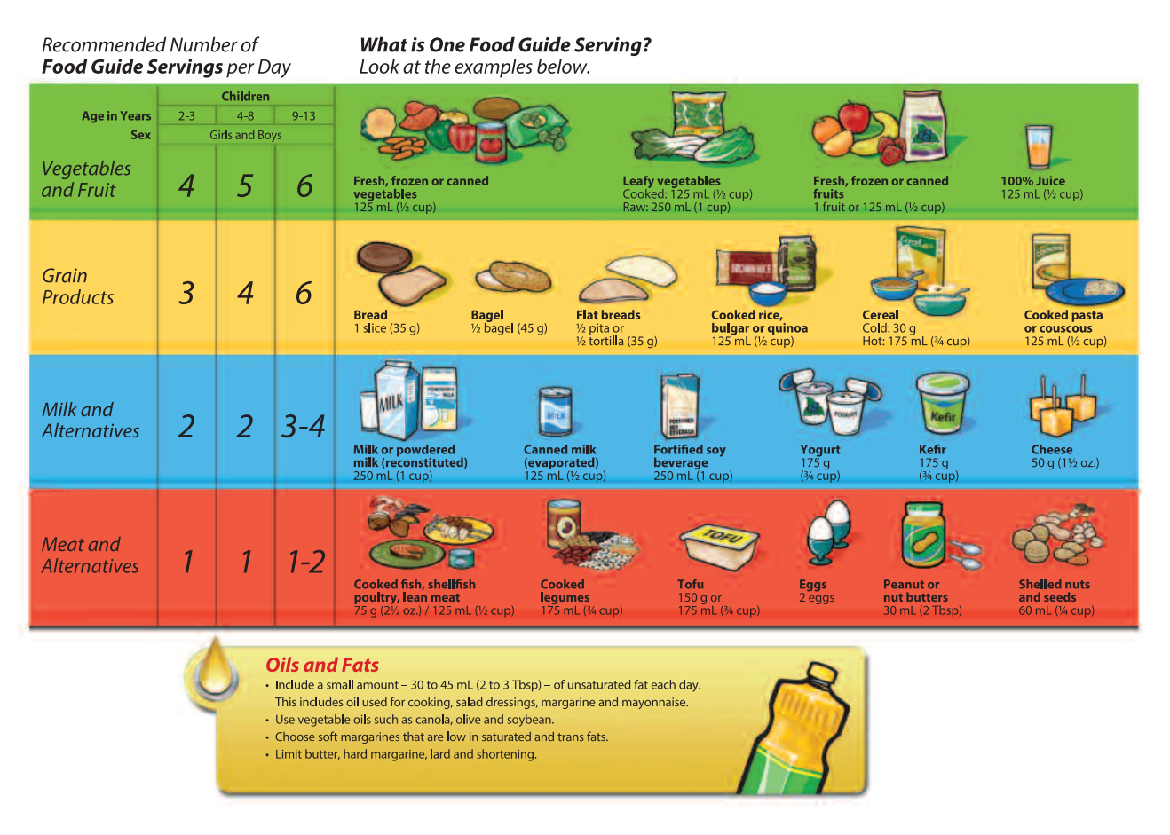
Table 1. Daily Food Guide Servings for Young Athletes (2 to 13 years old)