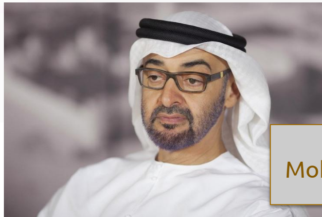
His Highness Sheikh Mohammed bin Zayed Al Nahyan Crown Prince of Abu Dhabi