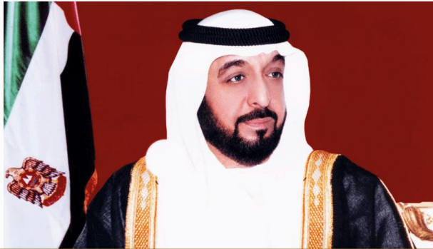
President & Ruler of Abu Dhabi Sheikh Khalifa bin Zayed Al Nahyan