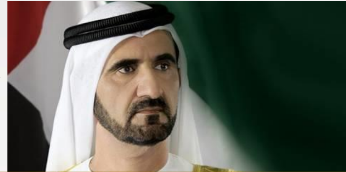
Prime Minister & Vice President & Ruler of Dubai Mohammed bin Rashid Al Maktoum