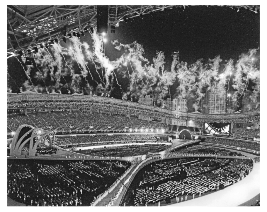
2007 Special Olympics World Games, Opening Ceremony, Shanghai, China.

generation, and likely the next, lies in recognizing and acting on the fact that the majority of people with intellectual disabilities in the world today are the scores of millions of people who live day-to-day in developing countries where they are denied health care, education, employment opportunity, basic human rights, and personal support. Special Olympics organizations are typically among the most viable nationwide organizations explicitly dedicated to improving the lives of people with intellectual disabilities in these poor countries and they often have excellent access to the business community and government leaders.