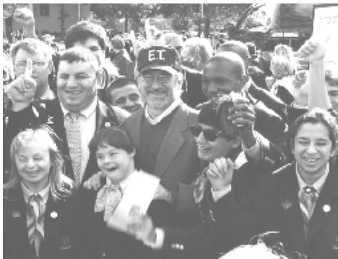
Special Olympics Global Messengers with director/producer Steven Spielberg at the World Premier of E.T. – The Extraterrestrial – 20 th Anniversary , held at the Shrine Auditorium in Los Angeles, California (USA).

Throughout this handbook you have been introduced to several Global Messengers from the Class of 2002. Each Global Messenger is charged with promoting a unique platform issue throughout his/her two-year term of service. Platform issues for the Class of 2002 include: school outreach, family involvement, nutrition and Healthy Athletes and corporate awareness and fundraising.