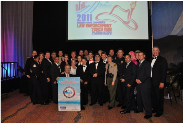
What an awesome experience to host the conference!