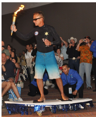
Catch the wave!