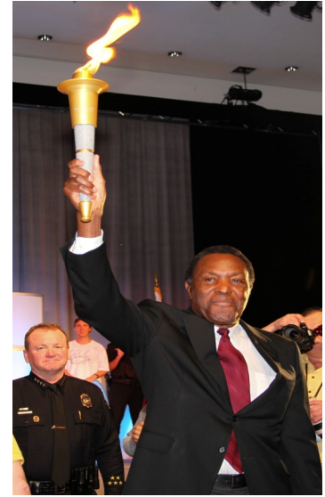
Rafer Johnson, Founder California Special Olympics