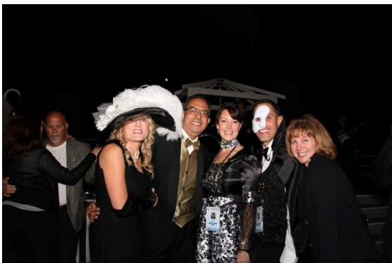
The Black and White theme aboard the Queen Mary was a hit for Torch Runners.