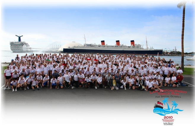
LETR IC Torch Runners