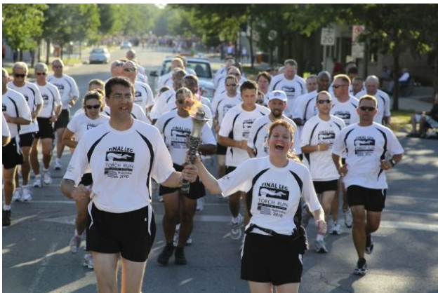
2010 Final Leg Torch Run — Nebraska