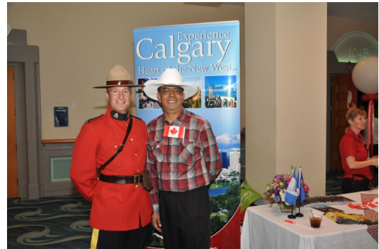
Calgary, here we come!