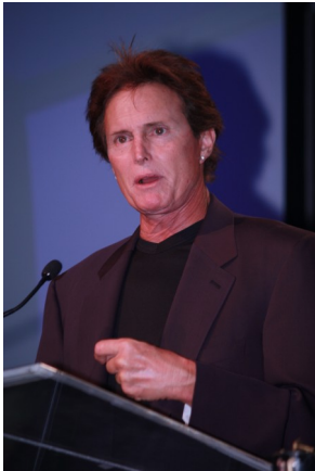
Bruce Jenner inspired us to set our goals high!