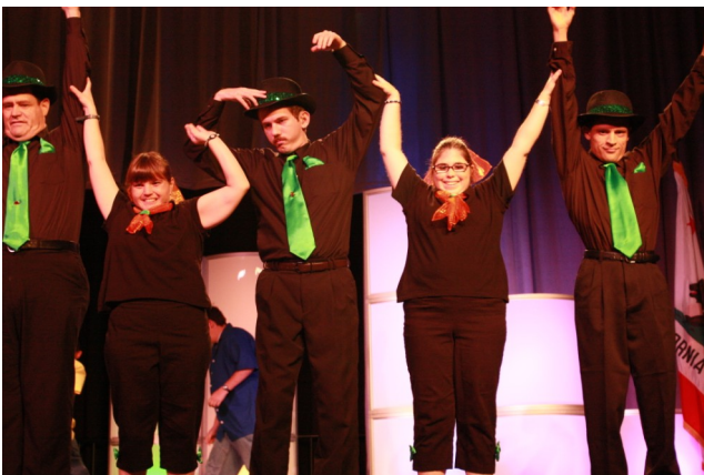
We were entertained by the High Tops Dance Ensemble!