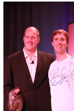
Jim Abbott's message of perseverance resonated with the audience.