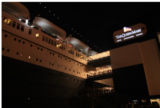
Host Night was on the elegant Queen Mary Ship.