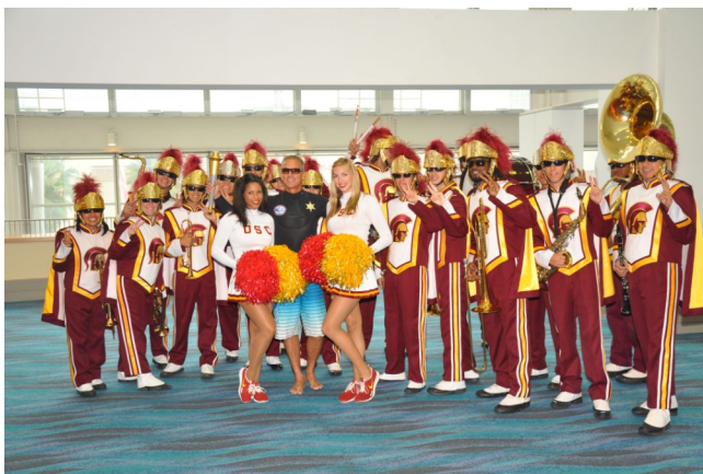
The USC Marching Band led the way for the Torch entrance.