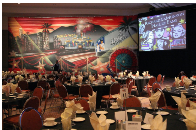
An Academy Awards to remember...as we honored our Torch Run heroes.