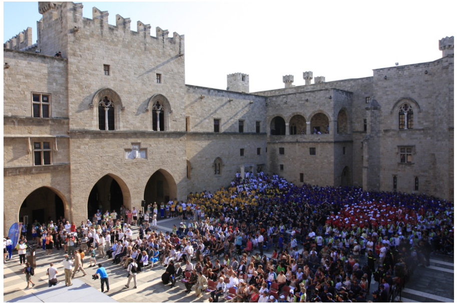
Final Leg Ceremony on the island of Rhodes with Host Town athletes and athletes from Team USA and other countries.