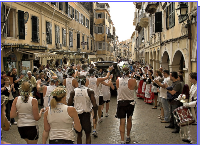
Final Leg Team on Crowded Street on the Island of Corfu, Greece