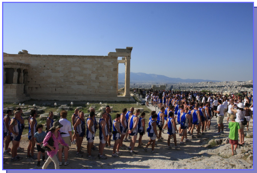
Final Leg Team Delivers the Flame of Hope to the Acropolis in Athens