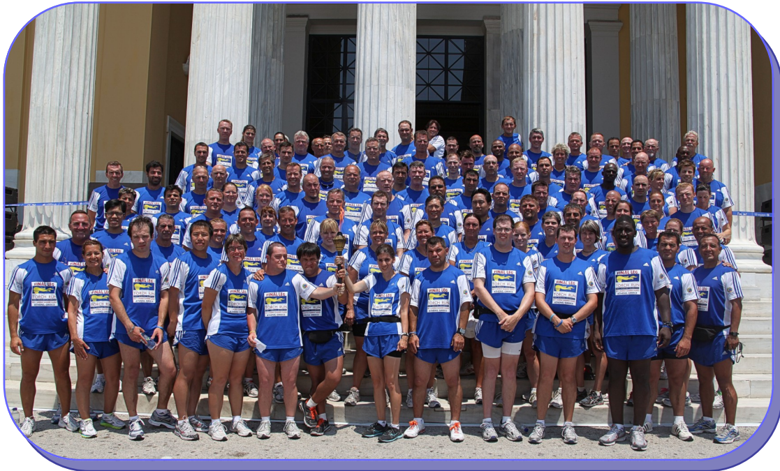
Final Leg Team A