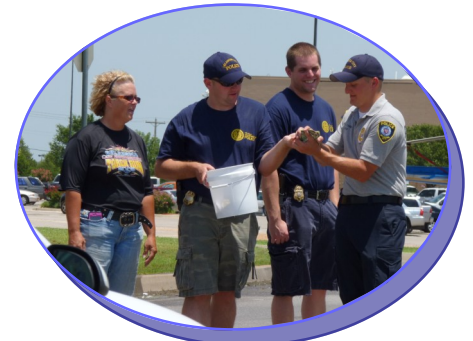
Multi Agencies of Oklahoma LETR Working Together at CODS 2011

This event has turned into a full day of fun for the entire family. Activities included displays of patrol cars, motorcycles, armored vehicles, Mobile Command Centers, mounted patrols, Beat the Heat police cars, rollover simulators, police robots and many other cool law enforcement gadgets. Kids walked away with coloring books, trading cards, stickers, tattoos and balloons.