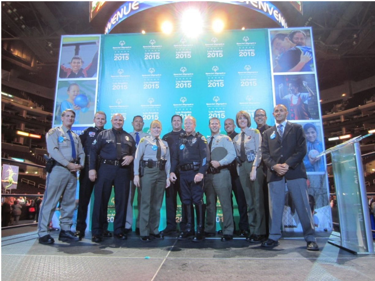
Southern California LETR Council Members at the press event to announce Los Angeles as the host of the 2015 Special Olympics World Summer Games in Los Angeles.

Los Angeles is honored for the opportunity to serve as the host in 2015 for World Summer Games. As so eloquently stated by Southern California representatives, "In a city full of movie stars and sports stars, Special Olympics athletes will be the stars of this show." Southern California LETR plans to have the Final Leg run throughout the state of California with ceremonies that include some bordering states.