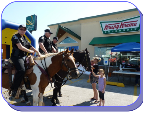
Mounted Patrol at CODS