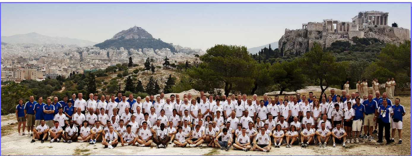
Entire Final Leg Team

The true leaders and motivators of our Team were the 10 Special Olympics athletes who were selected to participate. They spoke at every event, they carried the torch together in a unified effort with officers every step of the way, and they ran at the front of the running pack for 16 straight days. With the athletes leading the way, the Final Leg Team conducted over 130 ceremonies during this two-week period. At every ceremony an