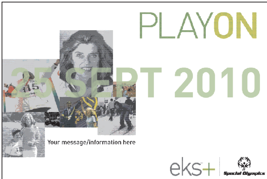
24" x 36" Horizontal banner

Samples of signage using photo collage of EKS, PLAYON, eks+ and Special Olympics logo, date of event and any message or information concerning an event or observance. Signage must include all mentioned elements.