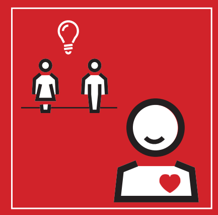
7. Open hearts & minds

5. Invite the public to play by passing the ball