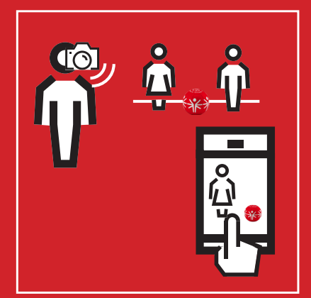
6. Capture the games & encourage guests to as well, share using #PlayUnified