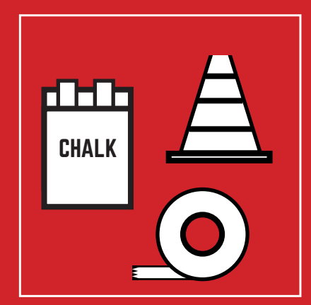
2. Bring supplies to create a soccer / football pitch