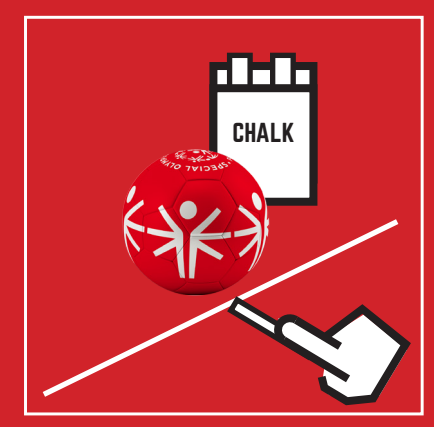
3. Draw out a 20'x15' soccer / football pitch with a goal