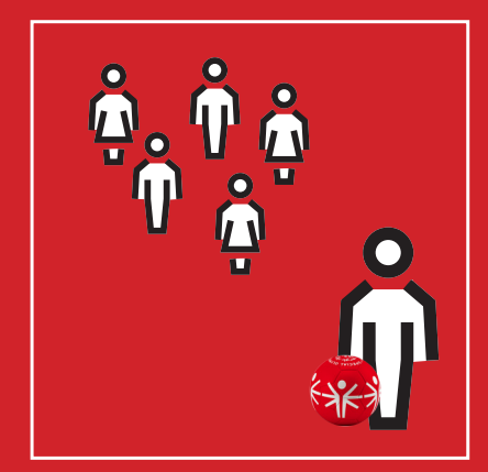
1. Head to a public space with our red ball