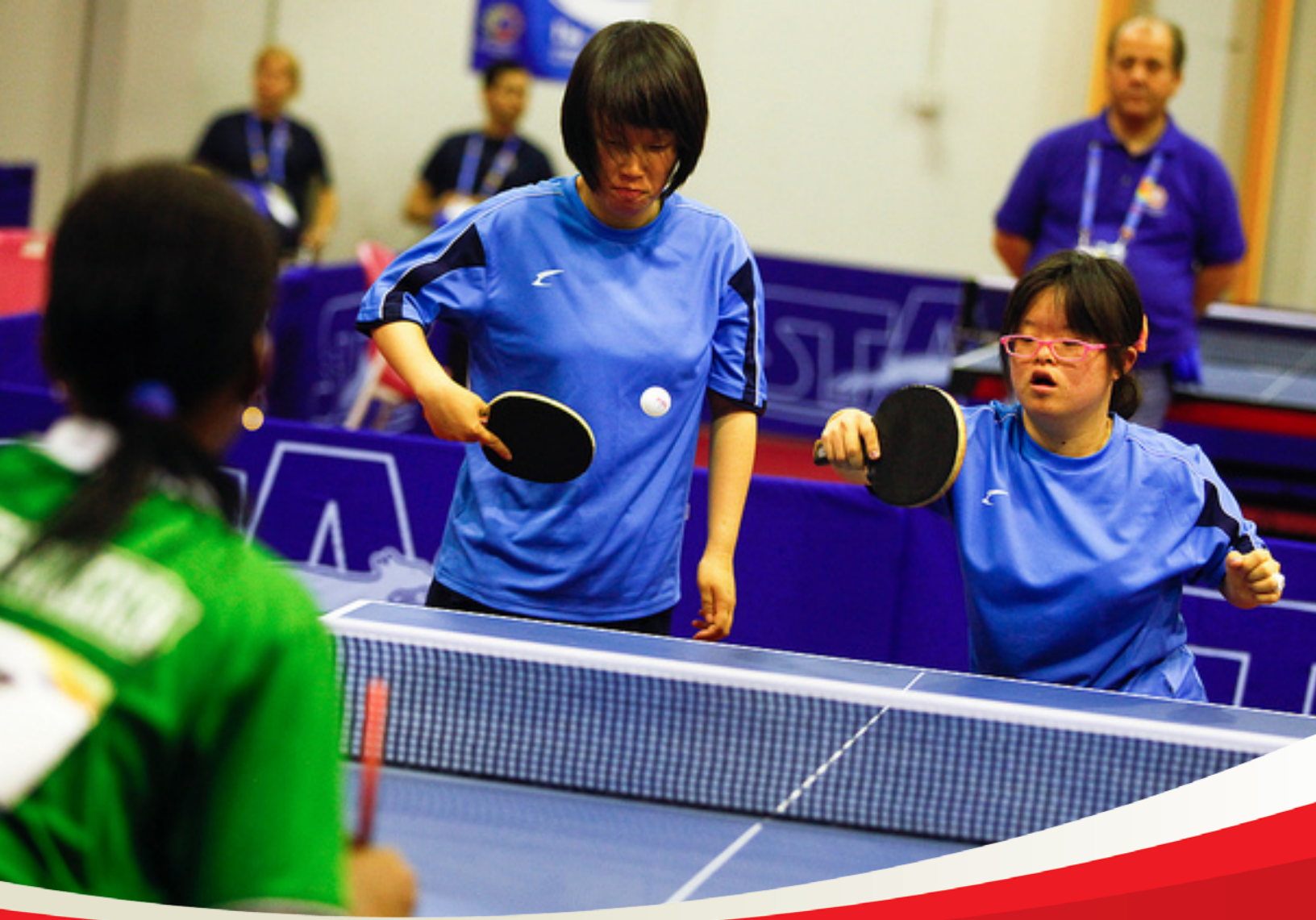
Table Tennis Sport Rules