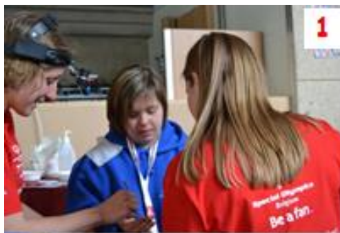
explain and show